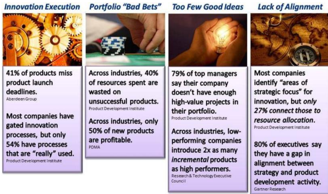
Figure 1: Barriers to Sustainable Market Differentiation. In Sopheon's experience, there are four common barriers to creating sustainable differentiation.

In our work over the years with hundreds of prospects and customers, we have identified four common barriers to creating sustainable differentiation. Part 1 of this white paper series focused on the challenge of successfully executing a gated process. Part 2 looked at what it takes to effectively manage a product portfolio. This paper addresses a third area of challenge—ensuring that your organization has a strong pipeline of high-value ideas feeding into your innovation process.