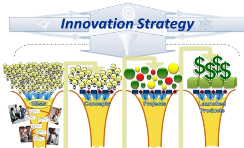
Figure 3: The Business Value of Strategy as the Driver for Ideation. Top innovators apply exceptional rigor to winnowing incoming ideas and making sure that resources are focused on those new product opportunities that have the strongest alignment with innovation strategies and the greatest commercial potential. This approach results in more product successes, significantly lower expenditures on product failures (in some cases up to 57% percent less), and more revenue from new products.

additional ideas. Enabling ideation process participants to easily make those connections facilitates serendipity and often increases the potential worth of ideas as they move through the front end of the innovation funnel. Solutions such as Sopheon's Accolade® Idea Lab™ can foster this connection by automatically notifying idea submitters and other stakeholders of ideation activity, thereby reducing the effort required to share new ideas.