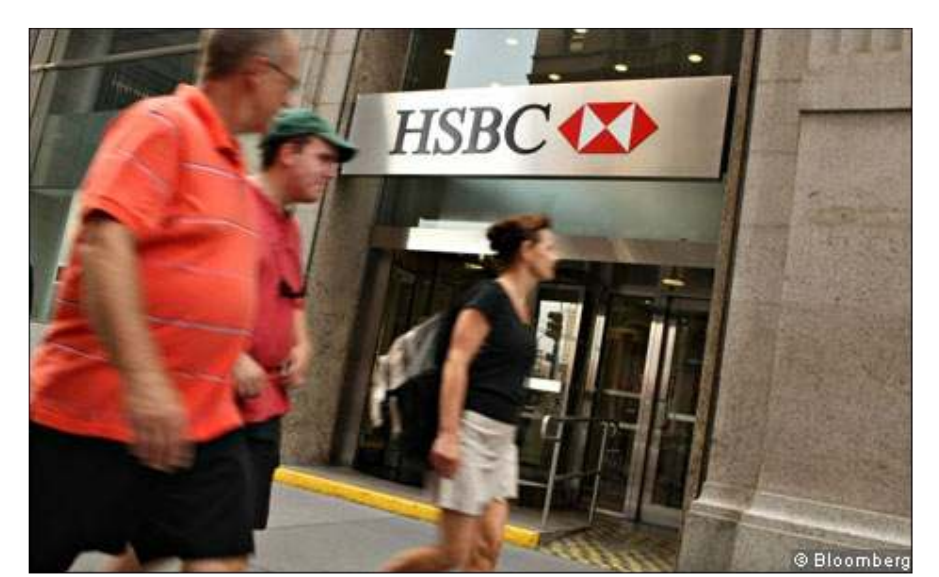
HSBC sold $750m in hybrids, with provisos

Published: September 23 2010 20:06 | Last updated: September 23 2010 20:06